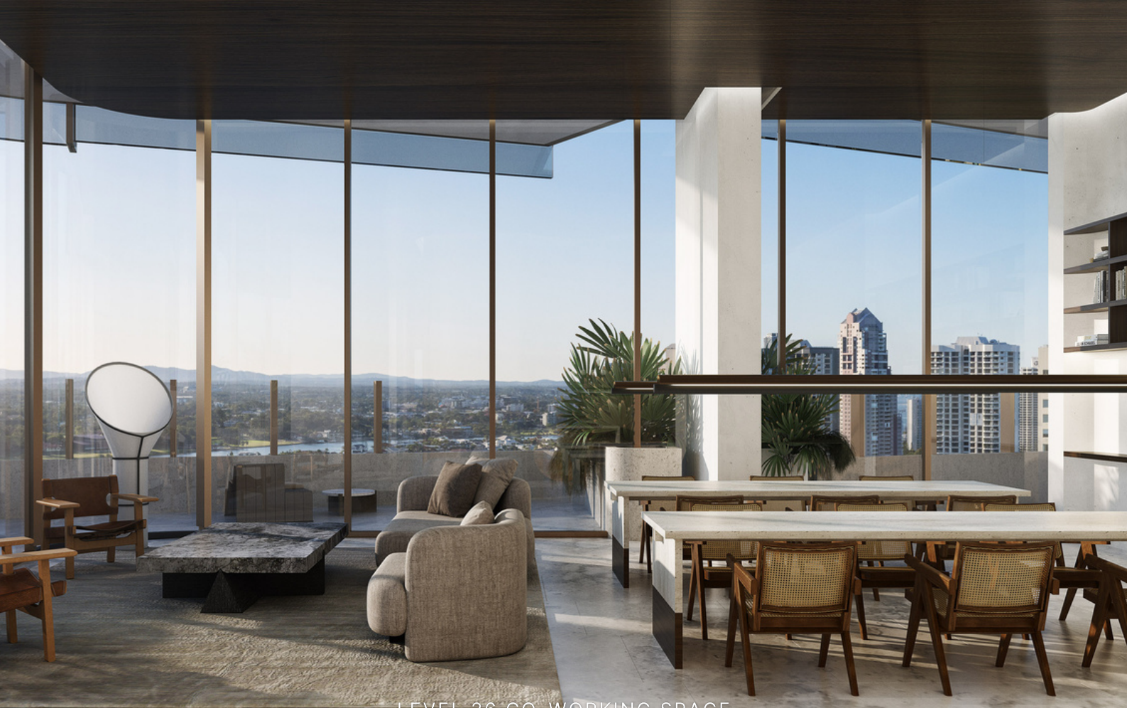
LEVEL 26 CO-WORKING SPACE