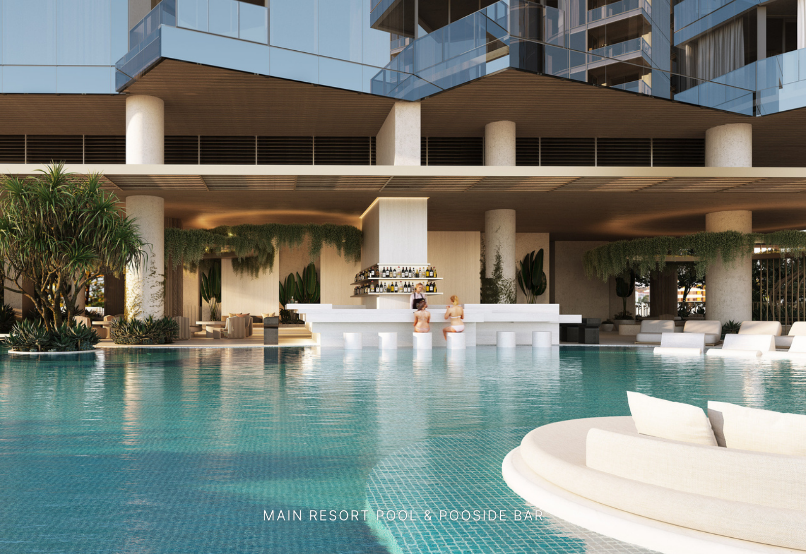
MAIN RESORT POOL & POOSIDE BAR