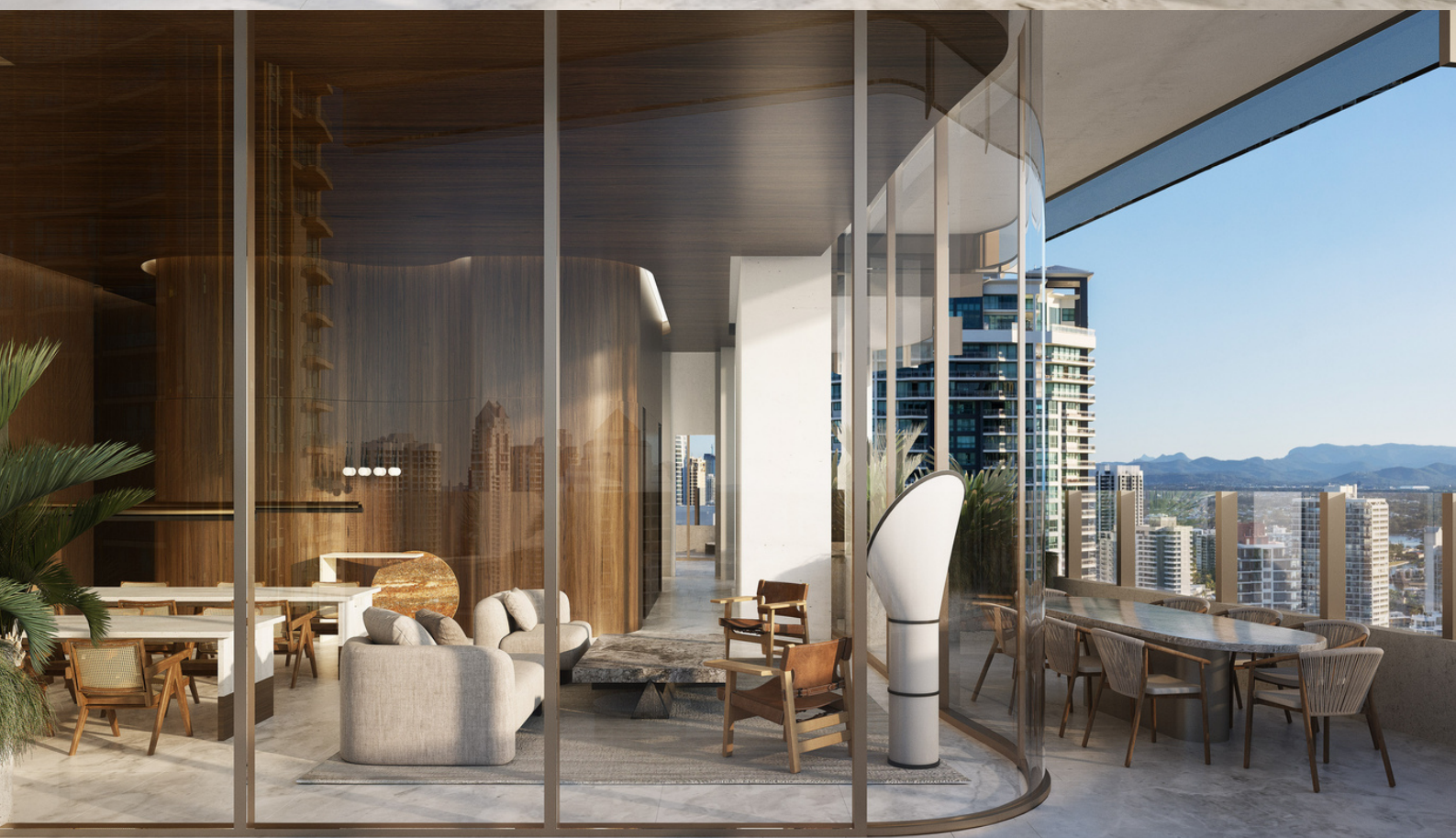
LEVEL 26 CO-WORKING SPACE