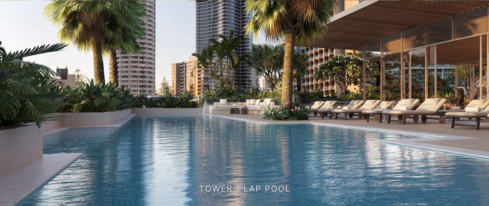
TOWER 1 LAP POOL