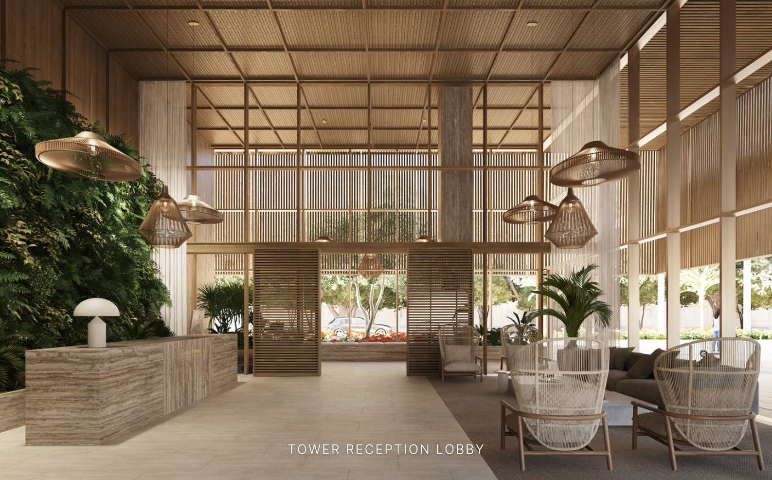
TOWER RECEPTION LOBBY